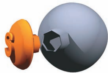
Signal molecule docking onto targeted organism to activate desired effect